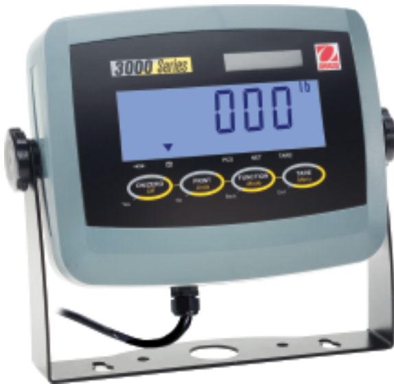
T31P Indicator shown with optional bracket