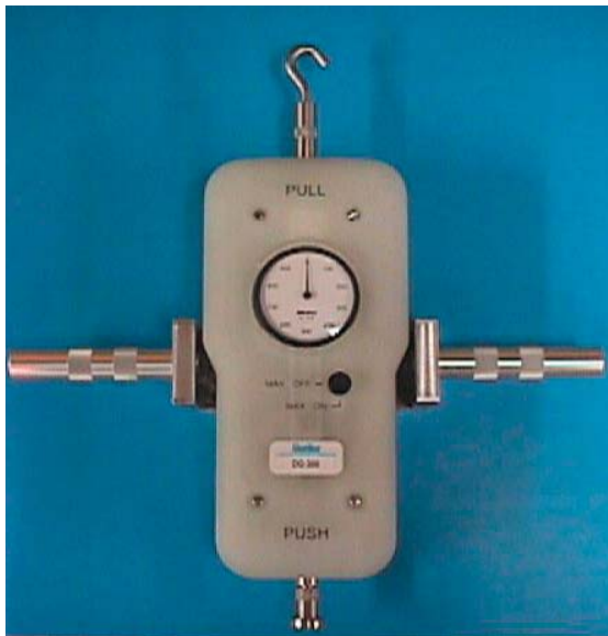
DG Series force gauge shown with optional Handle Set Assembly (p/n SPK-DG-Handle).