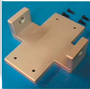
Optional Handle Set Assembly (p/n SPK-DG-Handle).