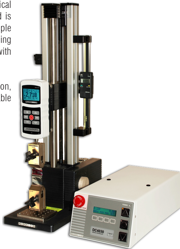
The ESM-DC is shown in a typical tensile testing application, with Series 5 digital force gauge, digital travel display, limit switch kit, and wedge grips