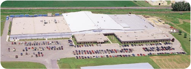
Avery Weigh-Tronix manufacturing facility – Fairmont, MN

Avery Weigh-Tronix has been an active force in advancing the state of scale design since 1813. Its products are recognized for durability that exceeds general industry standards and performance that reflects the latest advances in technology. Through customer satisfaction, Avery Weigh-Tronix has grown rapidly and is one of the world's largest manufacturers of commercial and industrial scales.