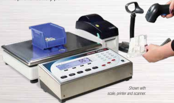
Shown with scale, printer and scanner.