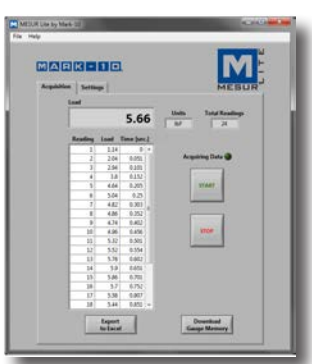
MESUR™ Lite data acquisition software is included with Series 7 gauges

Series 7 gauges include all the functions of Series 5 gauges, with several additional features, including high speed continuous data capture and storage, with memory for up to 5,000 readings at an acquisition rate of up to 14,000 Hz. The gauges also feature programmable footswitch