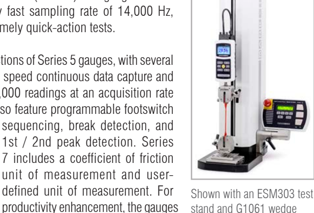
stand and G1061 wedge grips

the completion of break detection, averaging, external trigger, and 1st / 2nd peak detection.